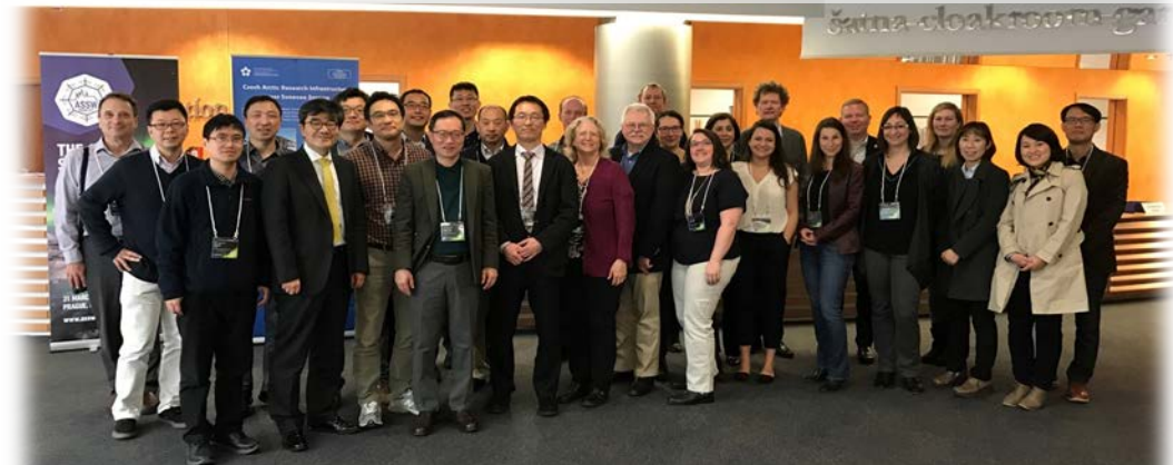
Group photo at PAG 2017 Spring meeting during ASSW 2017 in Prague