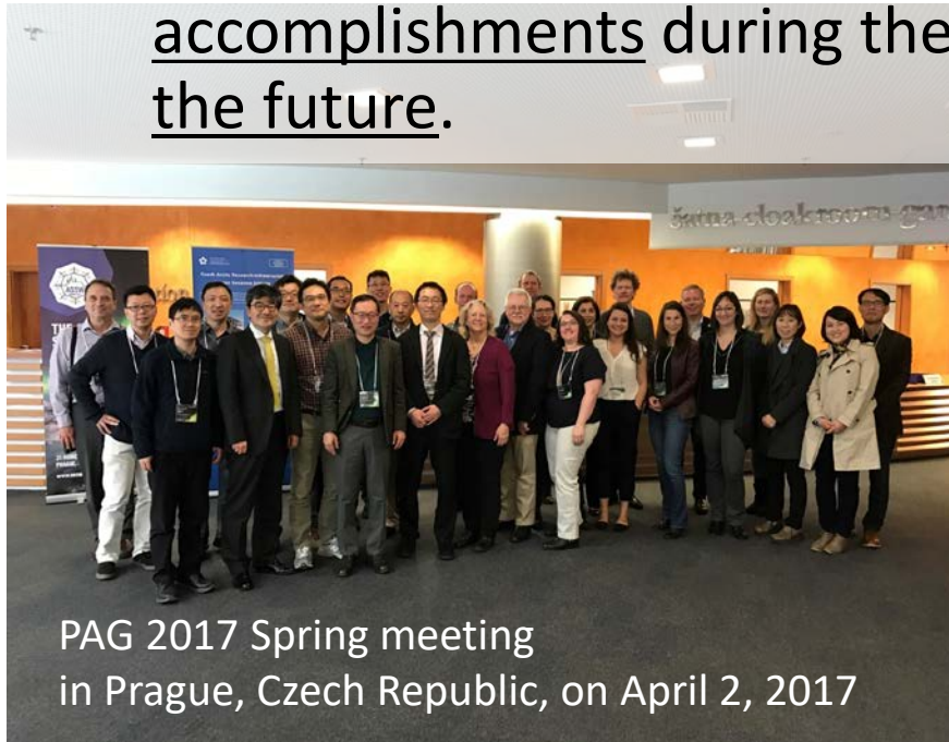
PAG 2017 Spring meeting in Prague, Czech Republic, on April 2, 2017