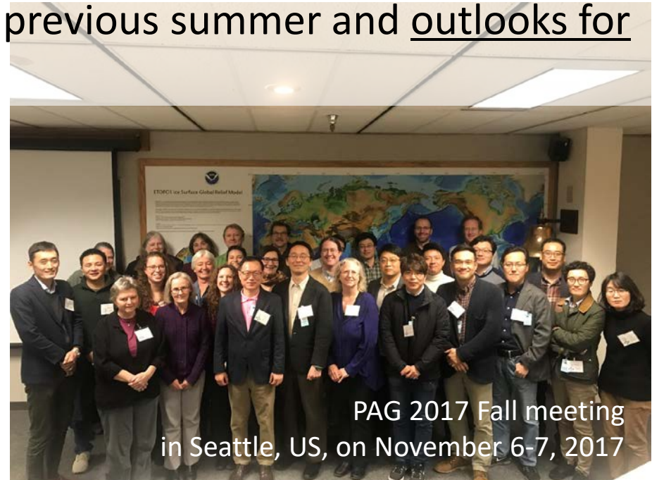
PAG 2017 Fall meeting in Seattle, US, on November 6-7, 2017